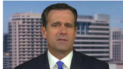
CIA Director John Ratcliffe

Trump stopped sharing our intelligence with Ukraine because Trump is mad at Zelenskyy. John Ratcliffe, who is the head of the CIA, said that this pause could be temporary, but others think otherwise. Ratcliffe also thinks that this pause is an effort to put pressure on Ukraine to get to the negotiating table.