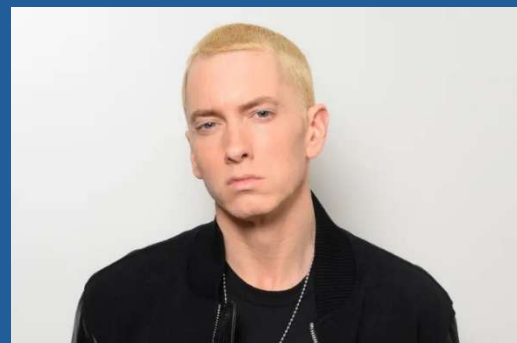
Eminem (Marshall Mathers)

The defendant faces up to 10 years in prison if convicted.