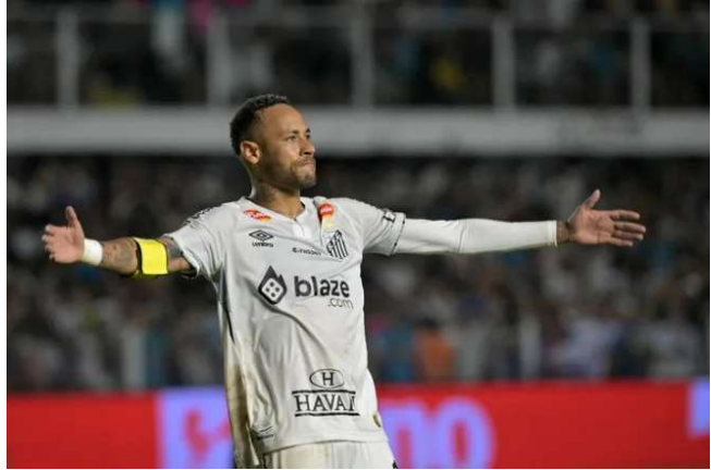
Neymar in action

Neymar had his first match with Santos Fc in February, at 1:00 am D.C. time. He was fouled one time, and he did not quit like usual. Neymar was named man of the match, and Santos tied with Botafogo SP.