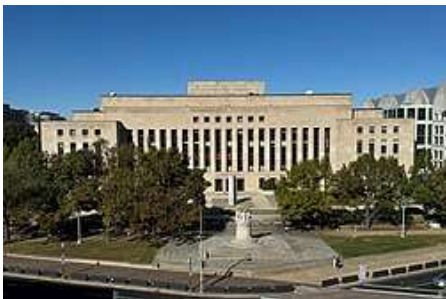
Federal courthouse in Washington, D.C.

Trump and DOGE are also firing people left and right. On top of firing thousands of people in the past couple months, they are particularly targeting people who have just recently started a job where they have less protection. Even if those people have worked in the government for a long time, they might have gotten a promotion, which means that they are very good at their job and have started a new one. However, because they've started a new job, they have less security and are being fired for no reason whatsoever even if they are good at their job. These are some reasons why lawsuits are being filed against Trump and his administration.