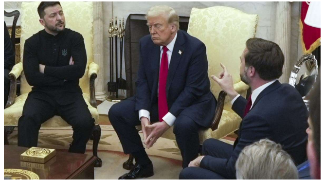
Volodymyr Zelenskyy and JD Vance argue in the Oval Office

Zelenskyy said that Trump wasn't helping Ukraine when they needed it the most. Also, Trump and Vice President JD Vance thought Zelenskyy wasn't showing enough gratitude for the U.S. Trump replied by saying that he wasn't in the White House earlier. Zelenskyy said that's why they need him to help now. This insulted Trump, and Trump started insulting Zelenskyy back.