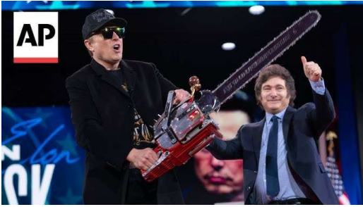
World's richest man, Elon Musk, oddly celebrates

Meanwhile, there are many lawsuits being filed against Trump. Elon Musk started a new organization called DOGE (Department of Government Efficiency), which is going around and stopping certain expenditures that they don't like, when Congress has already approved of them. This is causing some discord as people are wondering whether DOGE can be doing this and whether they should be doing this. The effects of stopping expenditures have already taken place, but none have had a good outcome so far.