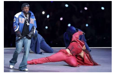
Kendrick Lamar and SZA perform "Luther" at the Super Bowl

We loved the message of the whole performance. One of the messages was about "forty acres and a mule."