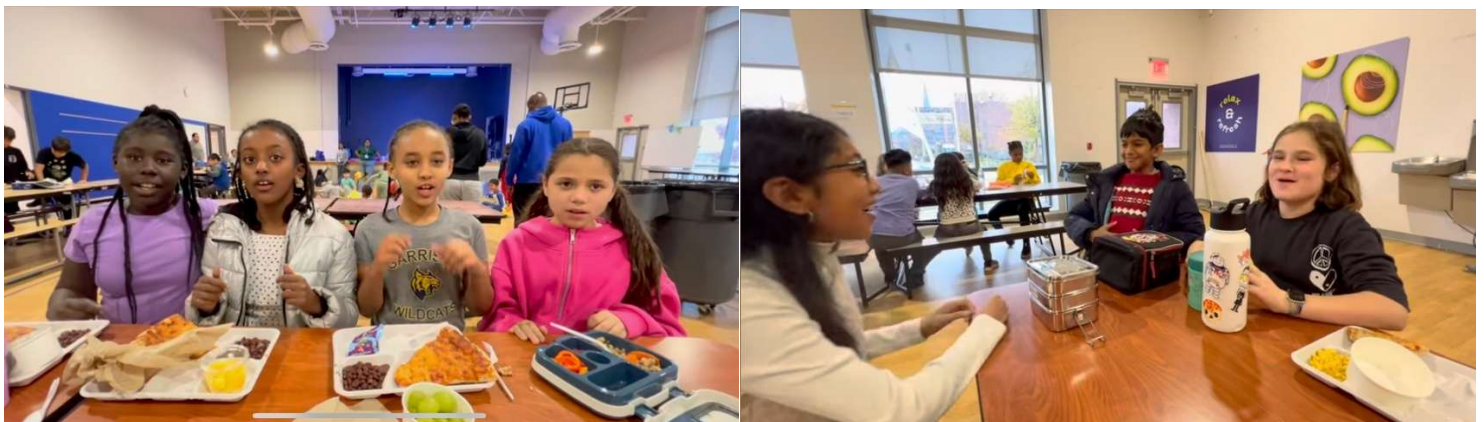
Students eat and perhaps discuss their favorite things about lunch

Well, that’s all. See you in the next paper, because we’re better than The New York Times!