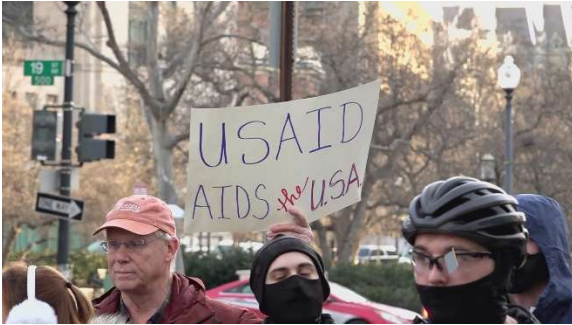
Fired federal workers protest

Well, to start, he fired thousands of federal employees. Some of these thousands of people were probably at the protest against the president's actions. Some people think that Trump's team is using Project 2025 to make changes to federal health programs.