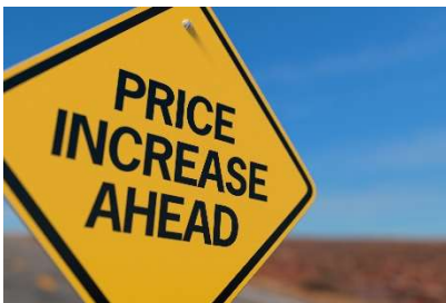
People are worried about inflation!

According to a report from CNN 10, "Inflation is going the wrong way, reaching its highest rate since June of last year." A lot of people are disappointed about this because one of Trump's promises was to make inflation go down. Inflation is the increase of prices of goods and services.